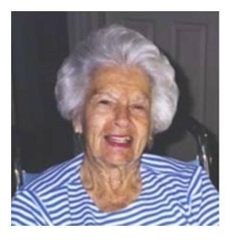
Born: July 09, 1918 Died: October 10, 2004

Services will be held at: No public services will be held.